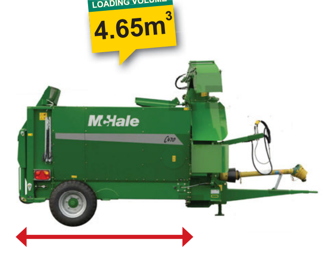
1.3M CONVEYOR LENGTH